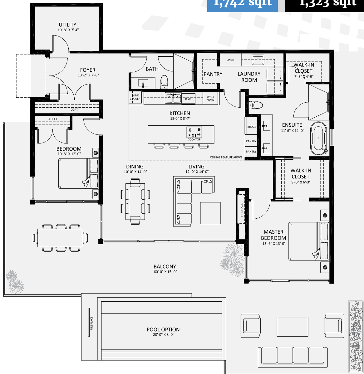
Image shown is an artist's conceptual rendering only. Conceptual renderings may not reflect the final product. The developer reserves the right to modify these designs without notice. The Developer reserves the right to make modifications to the product design, pricing and specifications without notice. Square footages are approximate and may vary E & O.E.