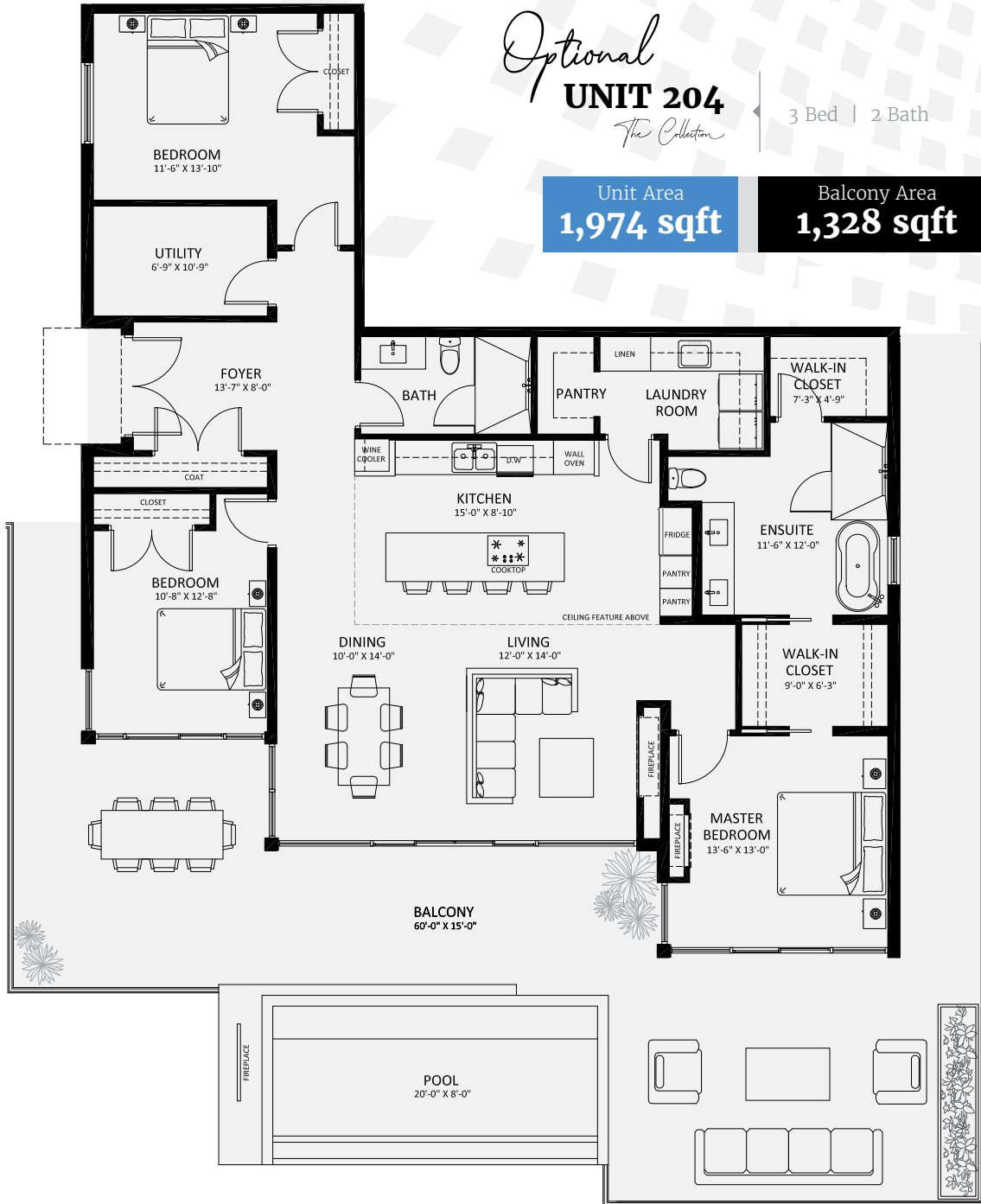
Image shown is an artist's conceptual rendering only. Conceptual renderings may not reflect the final product. The developer reserves the right to modify these designs without notice. The Developer reserves the right to make modifications to the product design, pricing and specifications without notice. Square footages are approximate and may vary E & O.E.